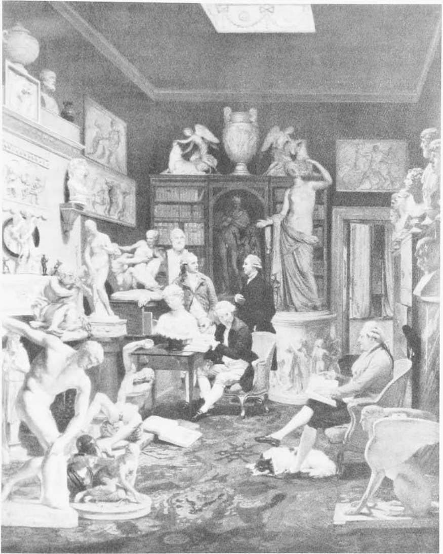
Figure 1.2. Charles Townley with his secretary Pierre-François Hugues d'Hancarville and his friends Charles Greville and Thomas Astle, by Johann Zoffany, painted 1781–83.