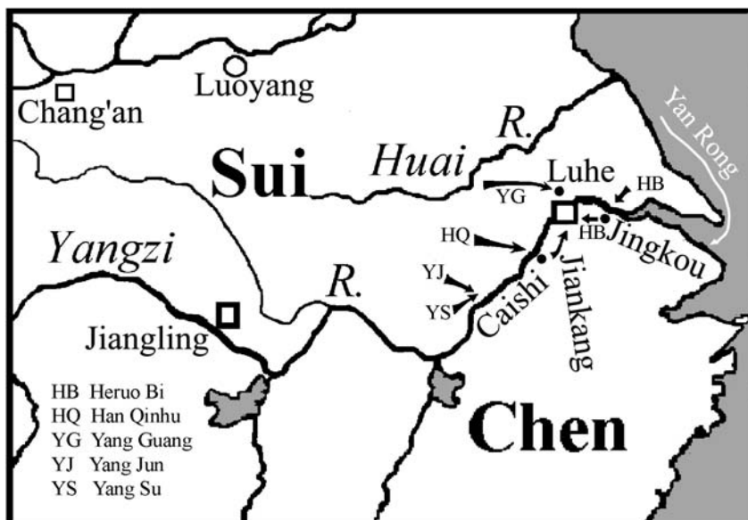
MAP 1.2 The conquest of Chen, 589

雍州牧). In 588, as the war against the Chen was imminent, he was appointed leader of the newly created Huainan Circuit, obviously to prepare for an administrative takeover of Chen territory.