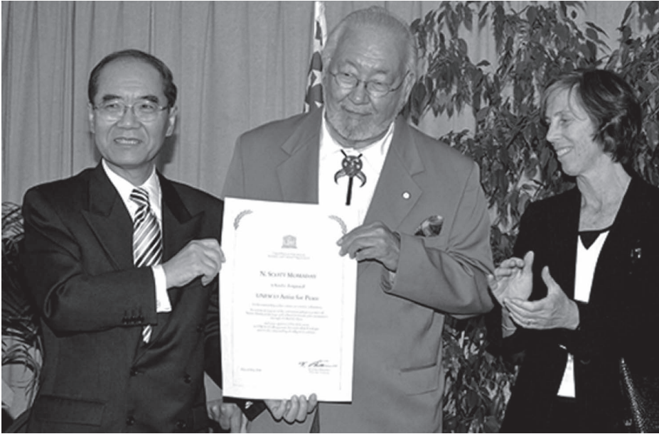
N. Scott Momaday in Paris (UNESCO). Nomination ceremony as Artist for Peace (May 2004) with Koïchiro Matsuura (Director General) and Louise V. Oliver, US Representative to UNESCO.

supportive of my activities on the international scene, on a UNESCO project dealing with the transmission of knowledge at Rainy Mountain, the recording of oral tradition for the young generation. Being involved with activities concerning Indigenous peoples over the world has allowed me to share my knowledge and to broaden my perspective.